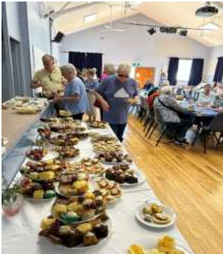
L: Just some of the food provided for $20 per head.