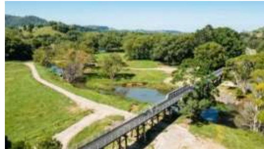
Above: Murwillumbah rail trail. Bridge restoration showcases rail history near Murwillumbah.