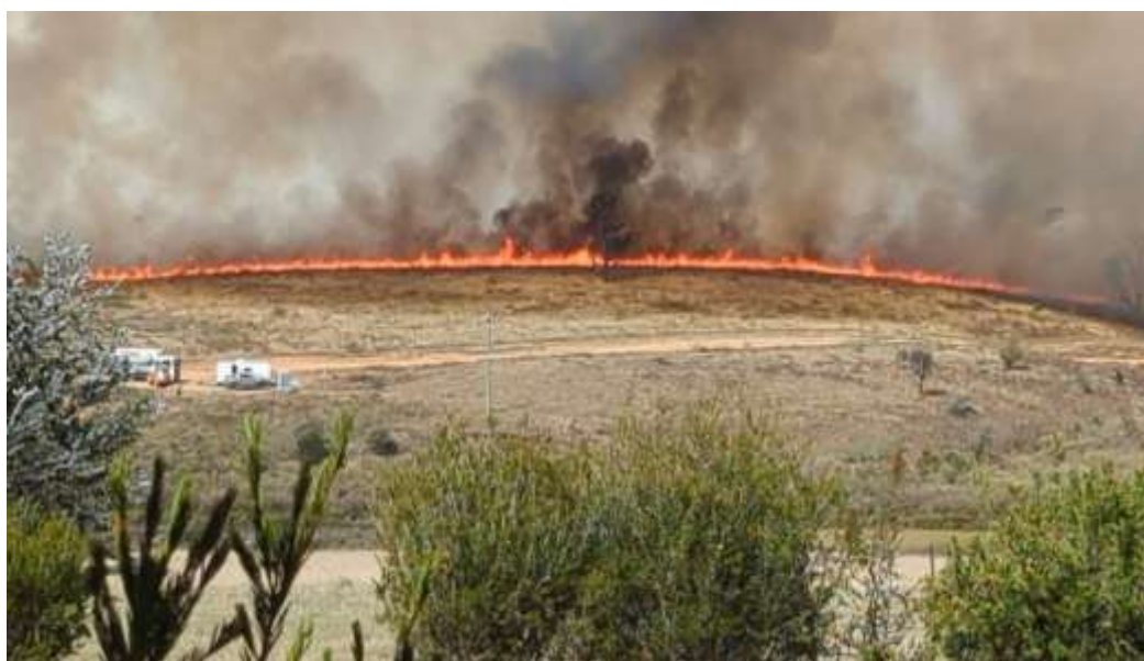
L: Bumbalong fire. 19 March

Note: the image at left is only a screenshot, not a link.