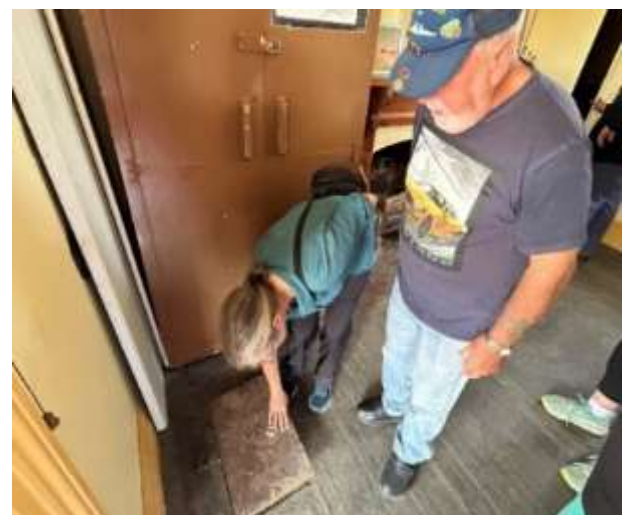
R: The ticket office floor's cubby-hole possibly stored ticket sales.